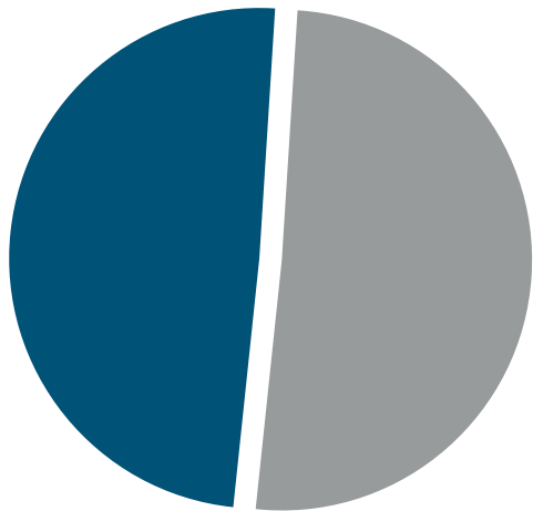
Practicing Kansas Physicians

KU aspires to meet the health needs of rural Kansans